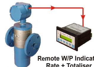
Remote W/P Indicator Rate + Totaliser + 20 mA Analog Output