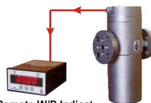
Remote W/P Indicator Rate + Totaliser