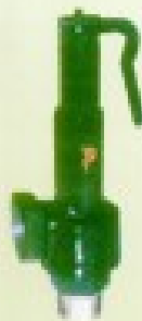
GUN METAL SAFETY VALVE