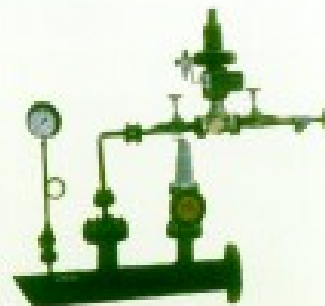
WATER CONTROL ASSEMBLY FOR DESUPERHEATING.