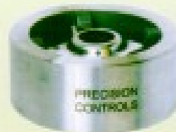
FLOW CHECK VALVE